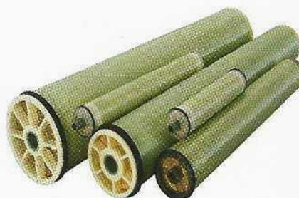
MEMBRANE & MEMBRANE HOUSING