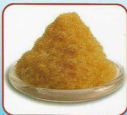
Ion Exchange Resin