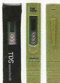
PRESSURE GAUGE & ONLINE METERS