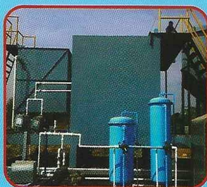
STP Plant & Chemicals