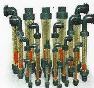
ROTA METER & DISTRIBUTION SYSTEM