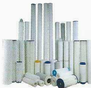
CARTRIDGE FILTER & MICRON HOUSING