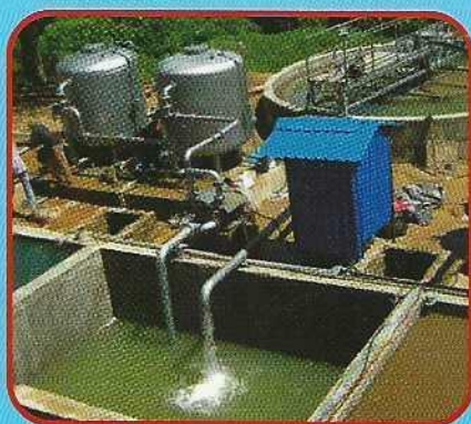
ETP Plant & Chemicals