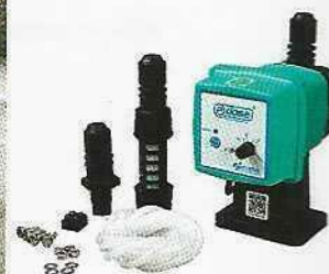
BAG FILTER ASSEMBLY & DOSING PUMPS