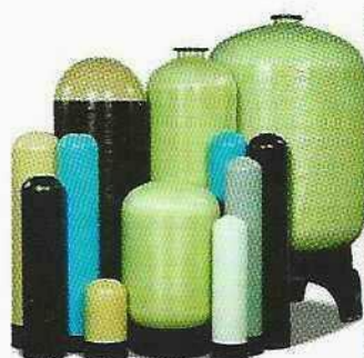
FRP & MS VESSELS