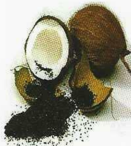
CARBON & MEDIA