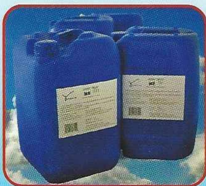
RO Anti-Scalent Chemicals